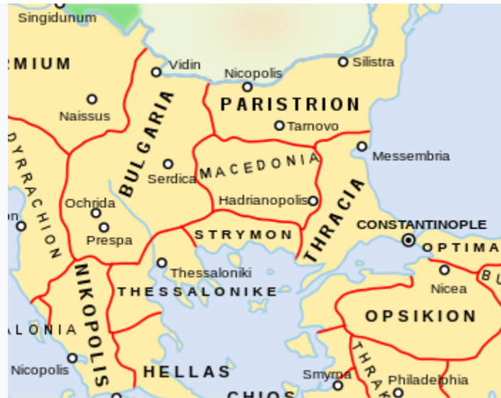
Administrative divisions of the Byzantine Empire in the Balkans c. 1045.

No evidence remains of major resistance or any uprising of the Bulgarian population or nobility in the first decade after the establishment of Byzantine rule. Given the existence of such irreconcilable opponents to the Byzantines as Krakra , Nikulitsa , Dragash and others, such apparent passivity seems difficult to explain. Some historians [55] explain this as a consequence of the concessions that Basil II granted the Bulgarian nobility to gain their allegiance.