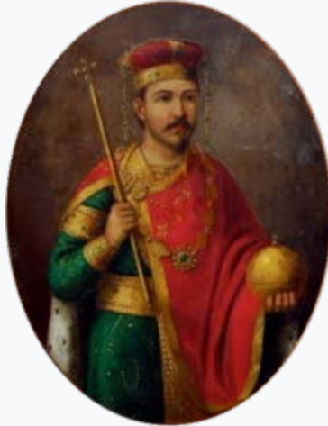
Ivan Asen II .

Resurrected Bulgaria occupied the territory between the Black Sea , the Danube and Stara Planina , including a part of eastern Macedonia , Belgrade and the valley of the Morava . It also exercised control over Wallachia and Moldova . [57] Tsar Kaloyan (1197–1207) entered a union with the Papacy , thereby securing the recognition of his title of " Rex " although he desired to be recognized as " Emperor " or " Tsar " of Bulgarians and Vlachs. He waged wars on the Byzantine Empire and (after 1204) on the Knights of the Fourth Crusade , conquering large parts of Thrace , the Rhodopes , as well as the whole of Macedonia .