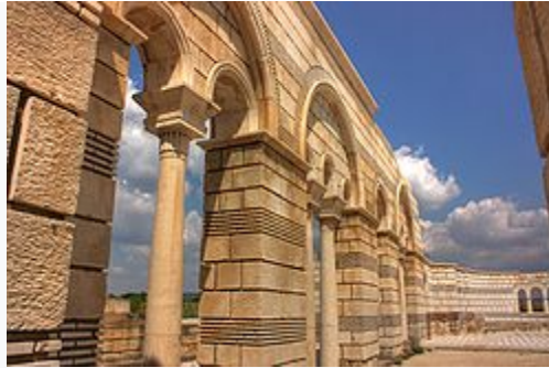
Ruins of Pliska, capital of the First Bulgarian Empire from 680 to 893.

rich literary and cultural activity centered around the Preslav and Ohrid Literary Schools , established by order of Boris I in 886.