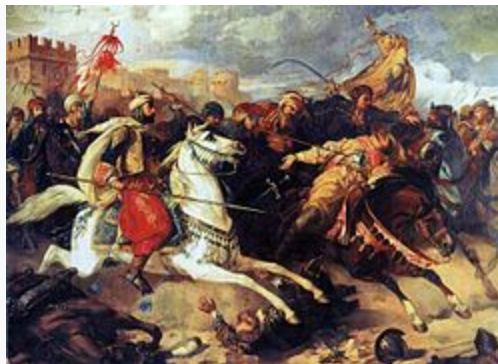
The Battle of Varna by Stanislaw Chelebowski.

In 1393, the Ottomans captured Tarnovo, the capital of the Second Bulgarian Empire, after a three-month siege. In 1396, the Vidin Tsardom fell after the defeat of a Christian crusade at the Battle of Nicopolis . With this the Ottomans finally subjugated and occupied Bulgaria. [ 37 ] [ 60 ][ 61 ] A Polish-Hungarian crusade commanded by Władysław III of Poland set out to free the Bulgaria and the Balkans in 1444, but the Turks emerged victorious at the battle of Varna .