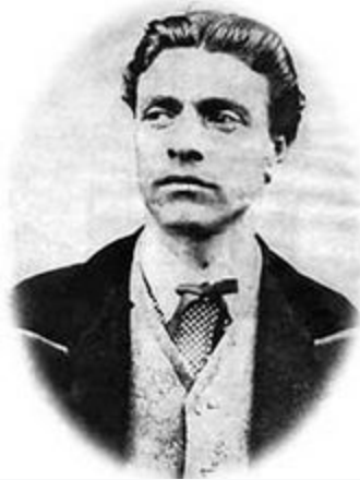
Vasil Levski , key figure of the revolutionary movement and national hero of Bulgaria

Bulgarian tradition calls this period the kurdjaliistvo : armed bands of Turks called kurdjali plagued the area. In many regions, thousands of peasants fled from the countryside either to local towns or (more commonly) to the hills or forests; some even fled beyond the Danube to Moldova , Wallachia or southern Russia . [37][64] The decline of Ottoman authorities also allowed a gradual revival of Bulgarian culture , which became a key component in the ideology of national liberation.